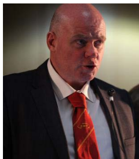
RMT Senior Assistant General Secretary

First of all, I would like to pay tribute to the French workers who are conducting a magnificent strike movement at the moment. It's an inspiration to absolutely everybody across Europe.