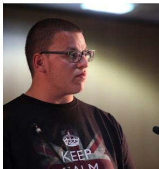
Student, LAE (Popular Unity) member, Greece