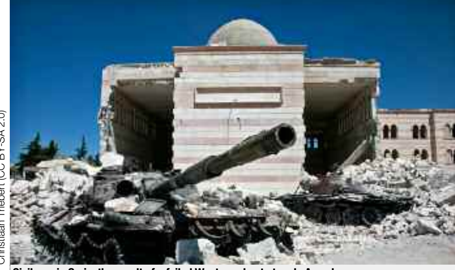
Civil war in Syria, the result of a failed Western plan to topple Assad.

'How Blair and Cameron misled the public.'