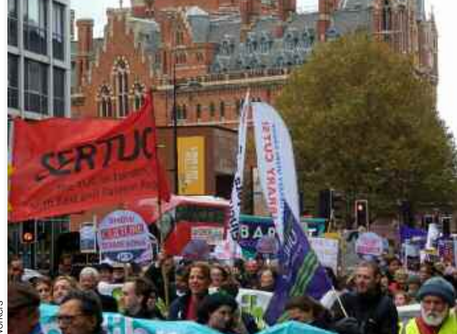
Demonstrators set off from the British Library, London.

Visit cpbml.org.uk to sign up to your free regular copy of the CPBML's newsletter, delivered to your email inbox.