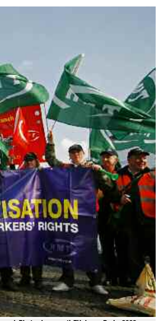
ersed. Photo shows anti-EU demo, Paris, 2008.

will shut down the whole British operation.