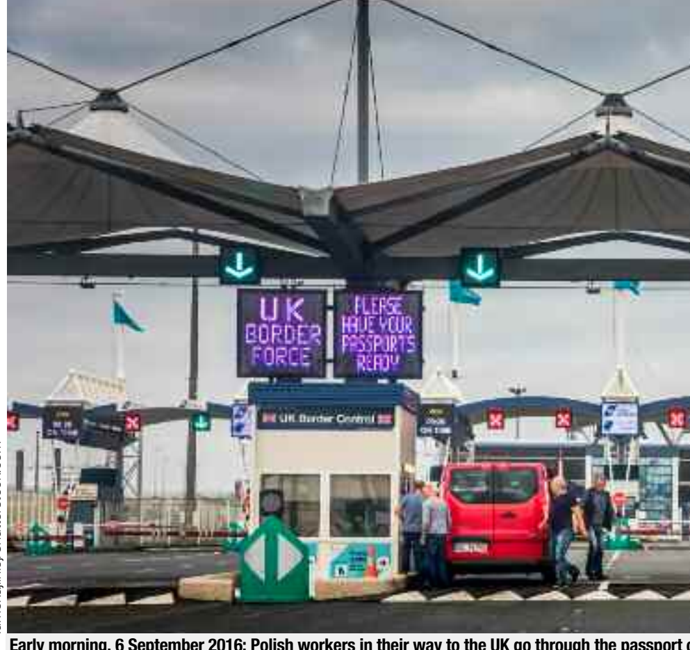
Early morning, 6 September 2016: Polish workers in their way to the UK go through the passport o

gave a net migration figure of 335,000. It means that 335,000 more people are living here than one year ago - more than the whole population of Coventry or Cardiff. There are six EU member states where the average wage is less than a third of our minimum wage and another eight where it is less than half. It is no surprise that of the recent record number of EU citizens coming to live in Britain, 54,000 came from Romania, which has the lowest wage rates in the EU.