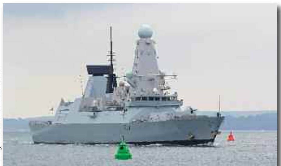
HMS Duncan, sailing inbound to Portsmouth Harbour.

Since Mitie can no longer make a profit out of health and social care, it's off out of it. These were the vultures queuing up to take over social care from local authority control, whose options now are either to sell it, shut it down, or even return it to local authority control. The economics of privatising home care which made Mitie millions in recent years are now driving it to quit.