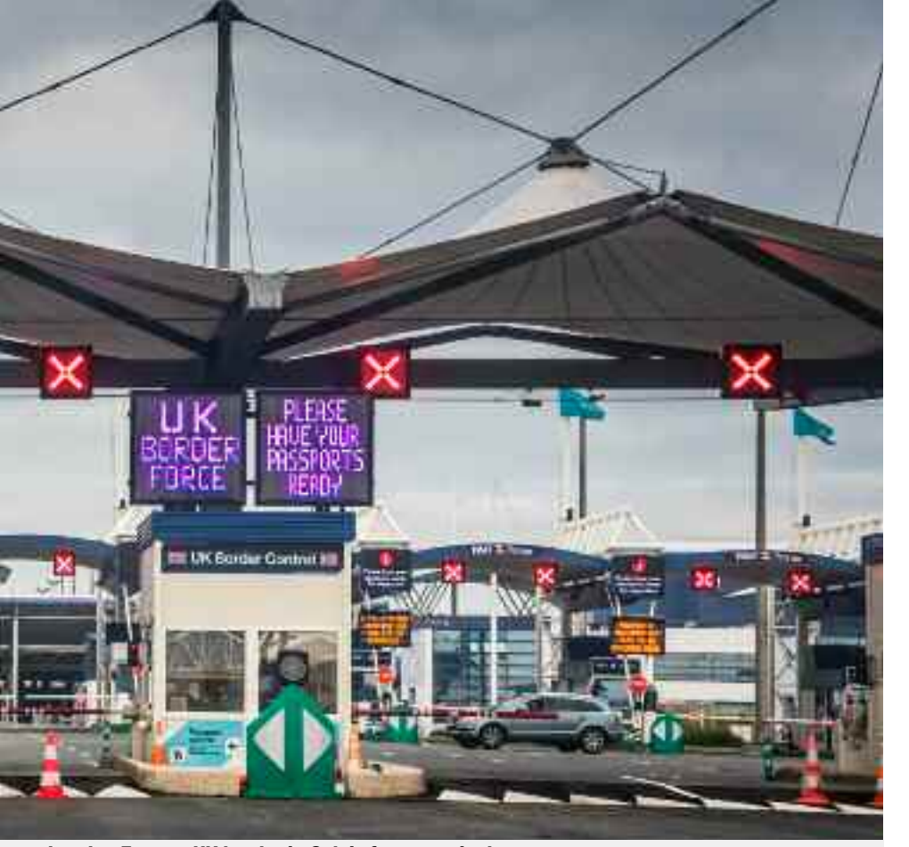
ontrol at the France-UK border in Calais ferry terminal.

typically have provided courses to young people (and older workers who needed to retrain) in skills such as electrical engineering, plumbing and information technology.