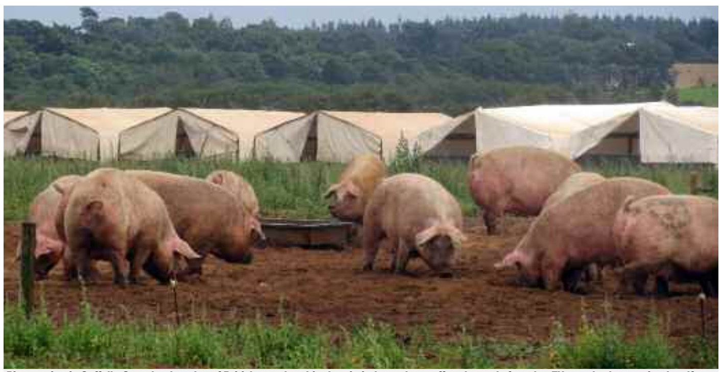
Pigs rooting in Suffolk. Over the decades of British membership the pig industry has suffered greatly from lax EU standards on animal welfare.

WITH BREXIT, the whole British working class has the opportunity to find new solutions to the problem that every human society, at whatever stage of development, has to face: how to feed the people.