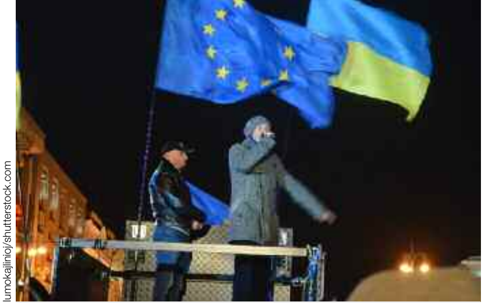
Maidan Square, Ukraine2013, with EU flags backing a coup against an elected government.