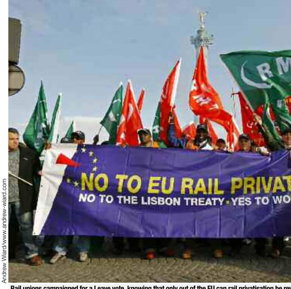
Rail unions campaigned for a Leave vote, knowing that only out of the EU can rail privatisation be rev

Labour has long cited the EU as the reason for it not being able to take the railways back into public ownership. The EU