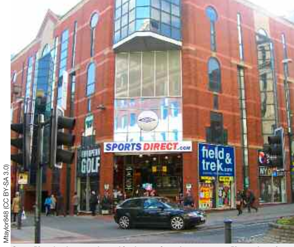
Sports Direct has become a byword for the use of zero-hours contracts. Picture shows its outlet in The Headrow, Leeds.

'We fool ourselves that the minimum wage has been breached.'