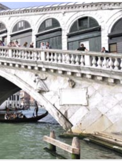
ry as merchants withdrew from active trade.