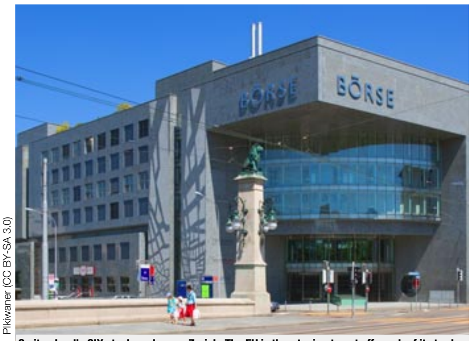
Switzerland's SIX stock exchange, Zurich. The EU is threatening to cut off much of its trade.

YOU'D THINK the European Commission had its hands full with Brexit, the Italian budget, Greece's debt-laden banks and the imminent fall of the Belgian government. Not to mention yellow vests in France. Or the Polish justice system. Now it has opened up a new front by attempting to strong-arm Switzerland into obeying its diktats.