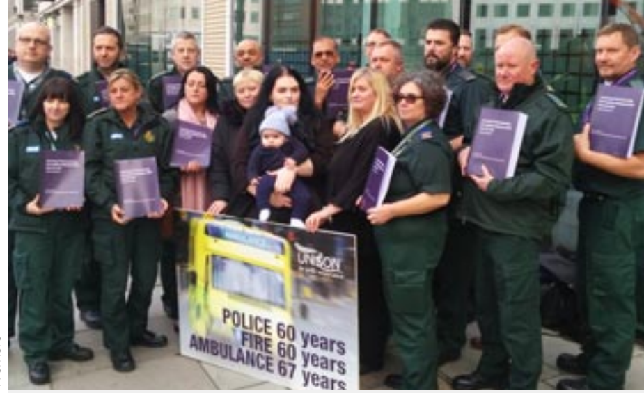
10 December: London ambulance staff, members of Unison, present a petition to the Department of Health and Social Care calling for a lowering of the retirement age from 67 to 60 – the age at which other emergency services staff retire.

Visit cpbml.org.uk to sign up to your free regular copy of the CPBML's electronic newsletter, delivered to your email inbox. The sign-up form is at the top of every website page – an email address is all that's required.