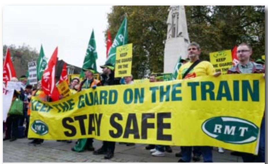
November 2016: RMT rail workers take their case to Westminster.

The BBC looked at examples of councils struggling with increased demand for services. Camden Council saw the cost of providing social care jump more than £11 million last year, while a 2 per cent increase in council tax reserved for social care raised just £4.8 million. Barnet Council needs to find savings of £67 million over three years, while Southwark Council, the country's biggest social landlord, saw 22,000 people use its drop-in housing service last year. It's clear that local government and its vital services will go under unless government policy is reversed.