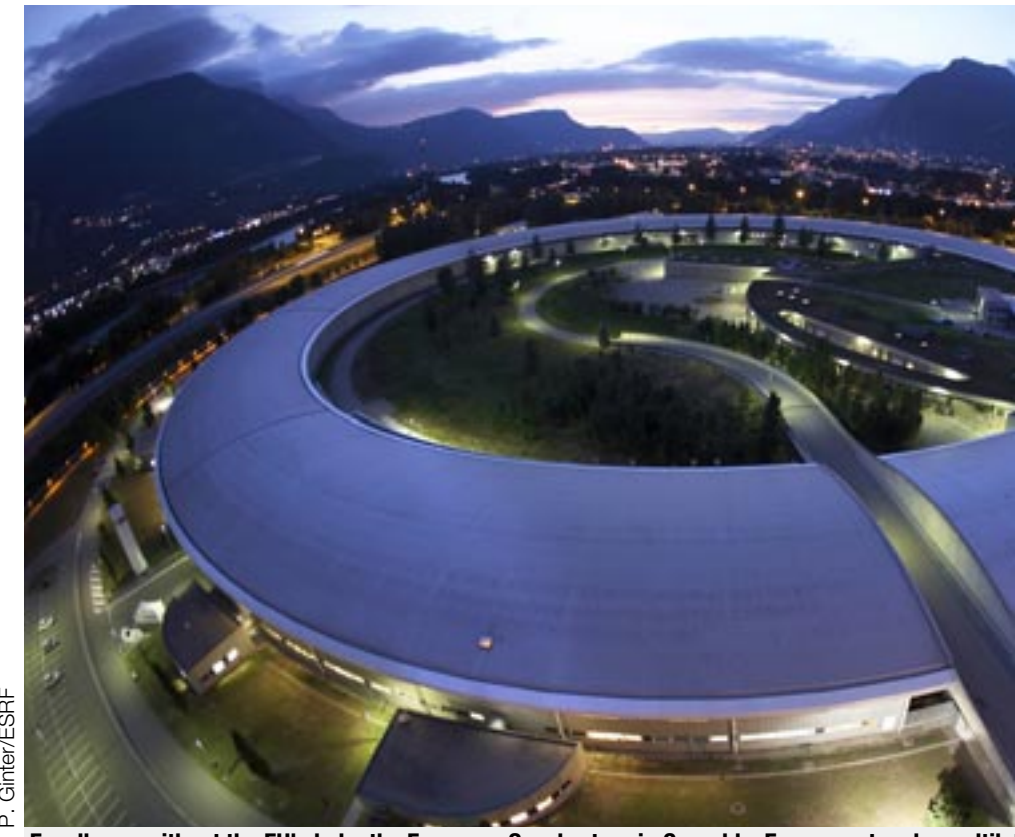
Excellence without the EU's help: the European Synchrotron in Grenoble, France, set up by multila

Figures on funding by the European Research Council indicate that the UK has been the largest recipient of research grants.