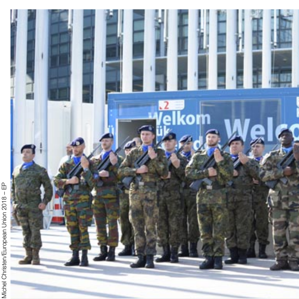
10 July 2018: a nice welcome to the European Parliament in Strasbourg, courtesy of the Eurocorps.

'By late 2017, the EU was starting to come out into the open about its military plans.'