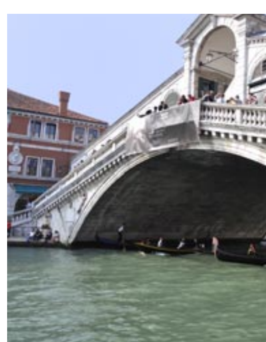
Venice: finance began to thrive in the 17th centu

A complex web of financial mechanisms has evolved to separate the ultimate owners of wealth from the businesses and enterprises that should be generating real wealth. The costs of the 2008 financial collapse