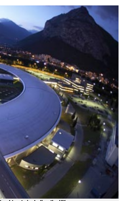
teral treaty including the UK.

than a ruling from the European Commission that they can use their own money to beef up the salaries of their own researchers who return to their native countries, without infringing the EU's state aid rules. (Yes, really, until now that has been deemed illegal!)