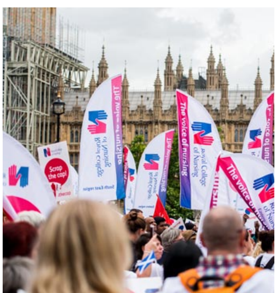
6 September 2017: nurses call for a pay rise and an end to the government cap.

YOU ONLY need to put two sets of statistics together to see that pay fluctuates with the changing size of the workforce. If the available workforce grows faster than the work available, as in recent years up to the 2016 referendum, pay goes down. If the workforce growth reverses as it has started to since the referendum, then pay goes up.