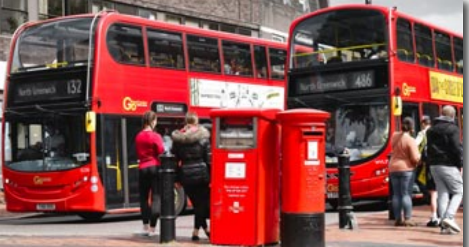
Buses in Bexleyheath, south London. Steep cuts to services are threatened.