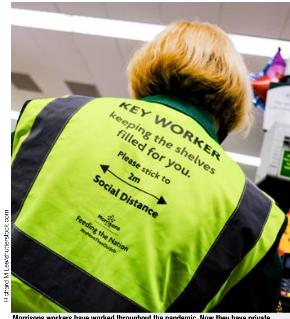
Morrisons workers have worked throughout the pandemic. Now they have private equity to contend with.

why. A study from the University of Chicago published in July 2021 found that when publicly listed companies are bought by private equity the number of workers shrinks by 13 per cent in two years.