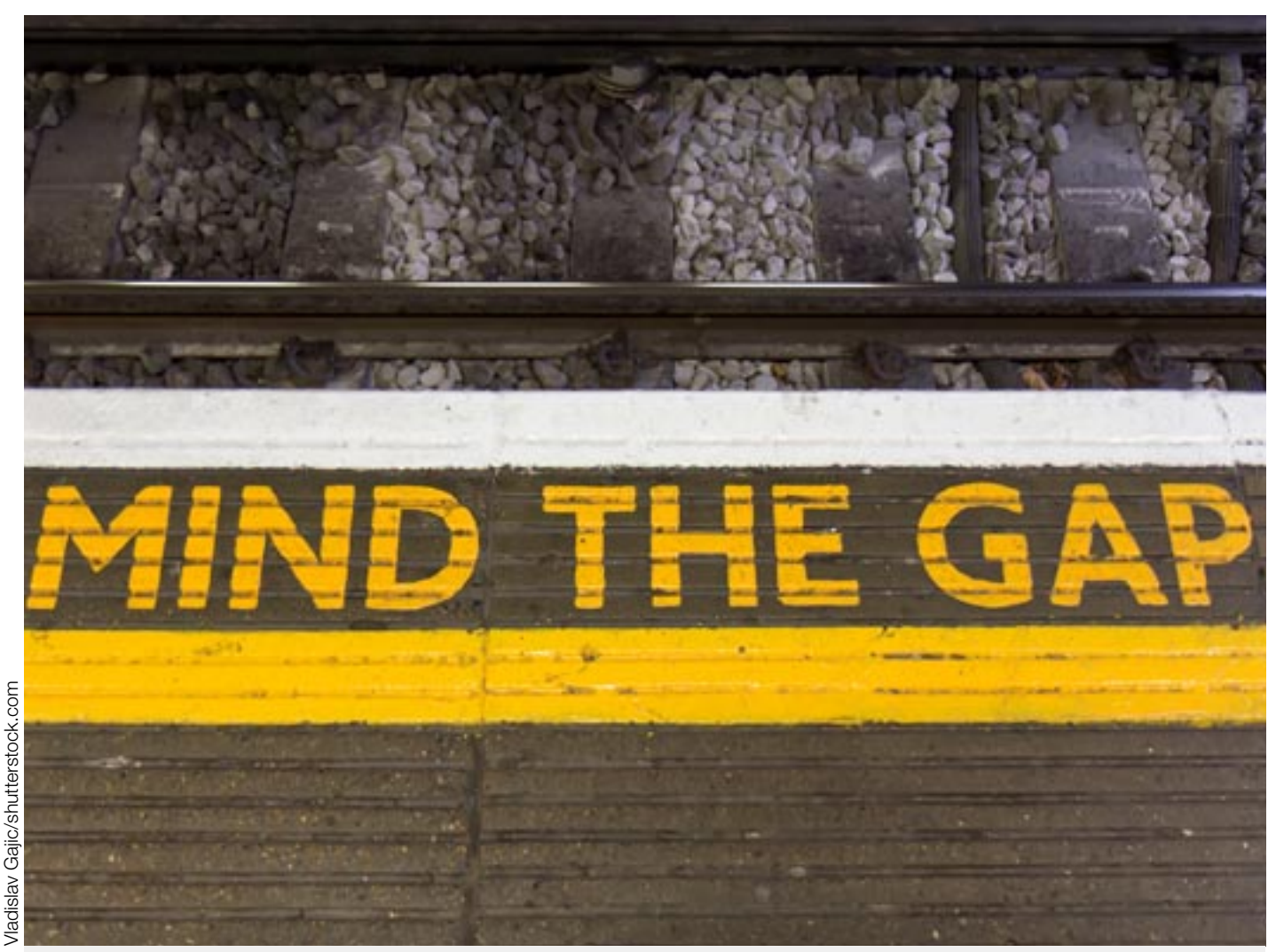
Slimmed-down timetables, electrification projects abandoned, HS2 cut short...short-termism rules.

BRITAIN'S RAILWAY industry stands at a crossroads. During the Covid-19 pandemic, passenger numbers and ticket revenues collapsed. Usage has recovered – buoyed up by strong leisure travel – but it is still down by around 30 per cent, with commuters down by around 50 per cent.