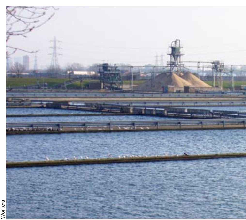
Thames Water treatment works, Walthamstow.

'Dividends have increased the costs to water users — that is, to all of us — by an average of £62 a household each year...'