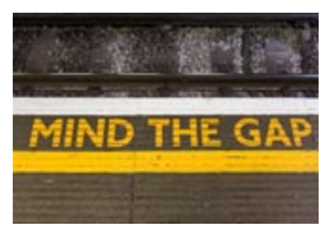
Continued from page 13

where average speeds are less than 50 mph. Bradford, a large city with poor rail connections, stands to lose out the most.