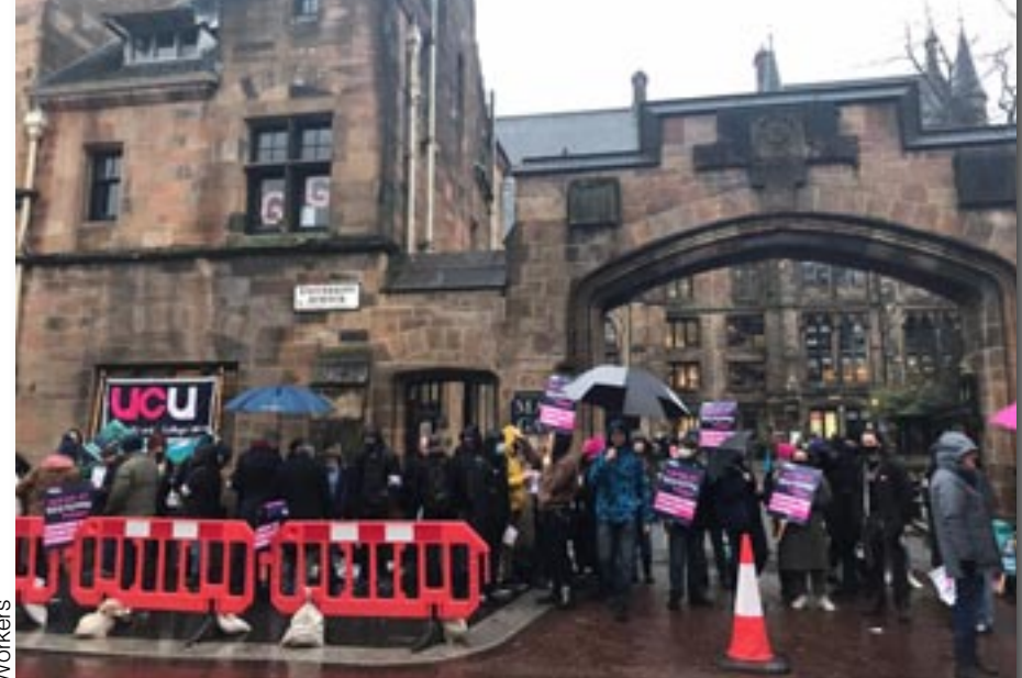
The picket line at Glasgow University on 1 December.

Visit cpbml.org.uk to sign up to your free regular copy of the CPBML's electronic newsletter, delivered to your email inbox. The sign-up form is at the top of every website page – an email address is all that's required.