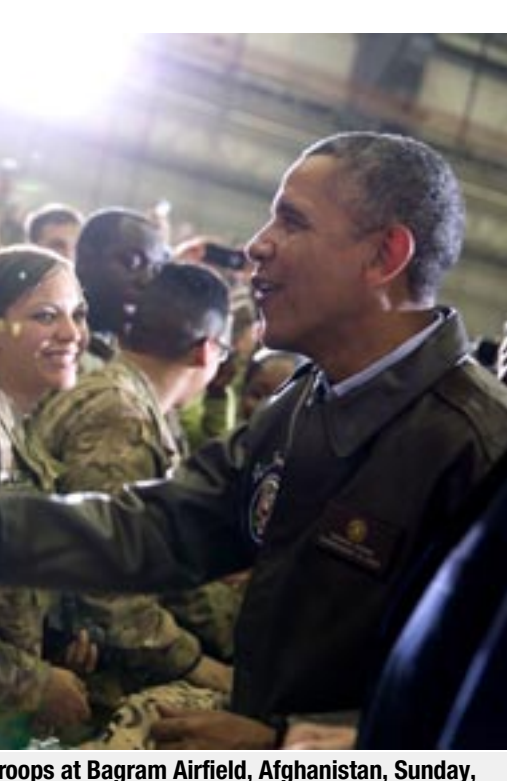
at bagiani An noia, Aignamotan, banaay,

bombing, torturing and making them refugees.