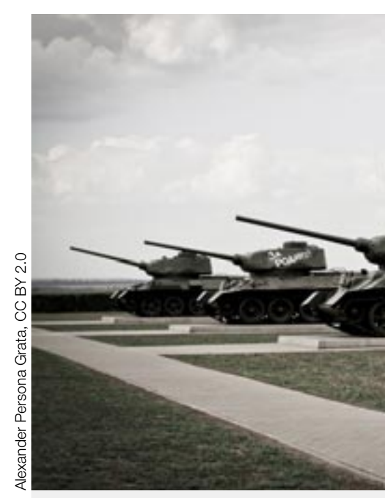
T-34 monument at Prokhorovka, site of the Battle of during the Battle of Kursk.

breached. After 6 July the Luftwaffe was forced to prioritise air-support missions. It was unable to intercept all Soviet airstrikes and the balance of power in the air began shifting.