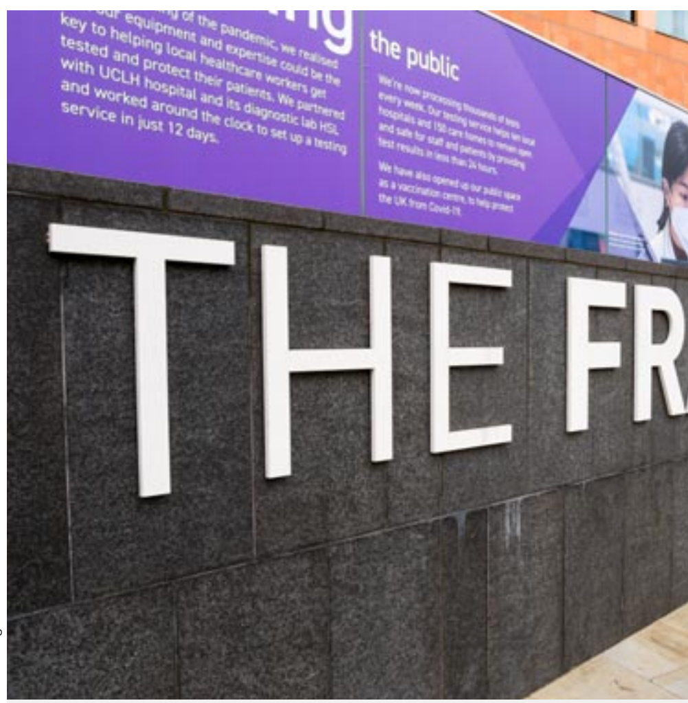
The Francis Crick Institute, London, the biggest single research centre in Europe – and created

'It's not as though Horizon Europe is the only option...'