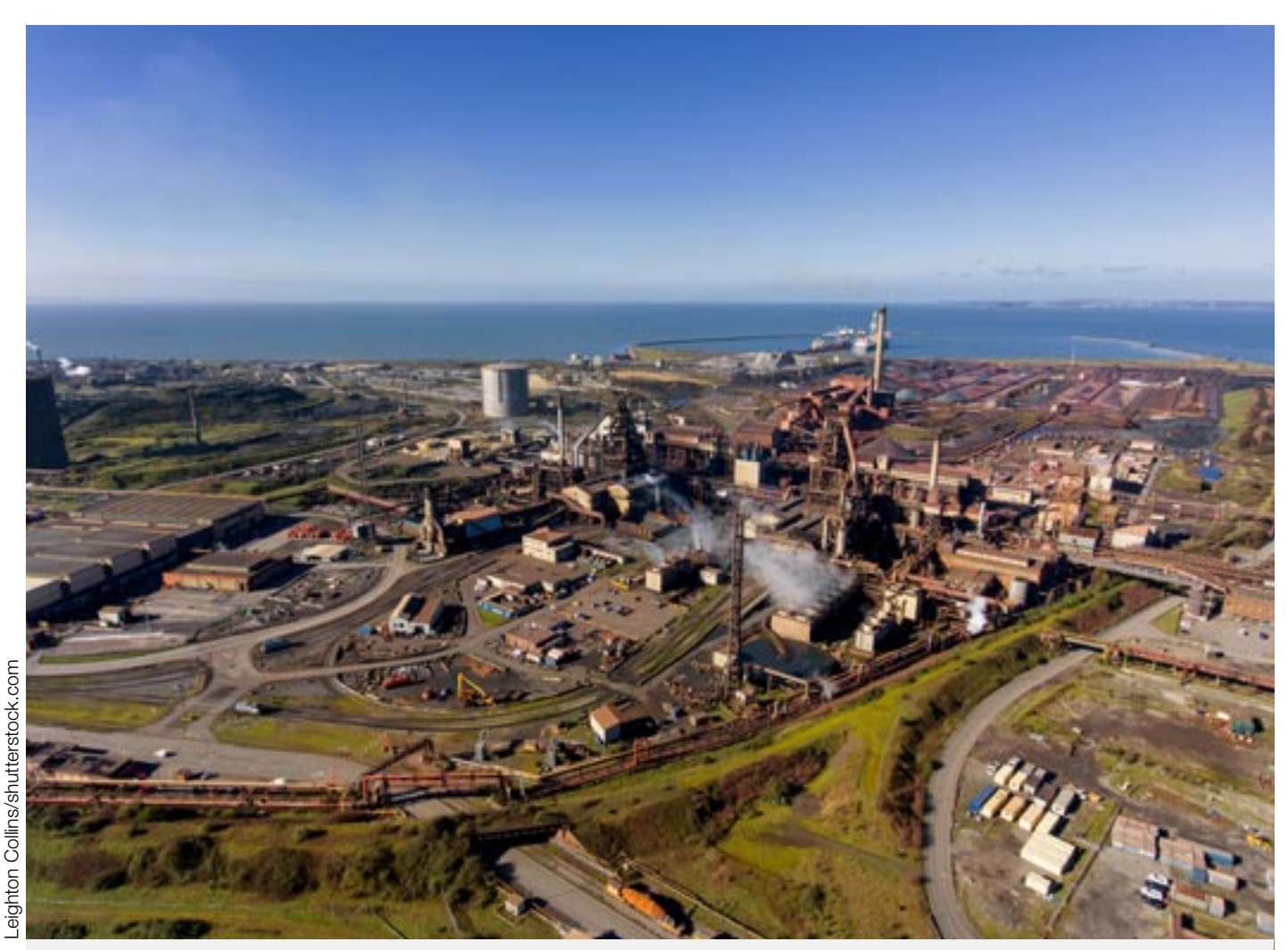
Port Talbot steelworks, South Wales. It is owned by the Indian conglomerate Tata.

THE BRITISH STEEL industry now hangs by a thread. In 2019, British companies produced a mere 7 million tonnes of steel. In contrast, the EU produced 157 million tonnes, and China made 996 million tonnes.