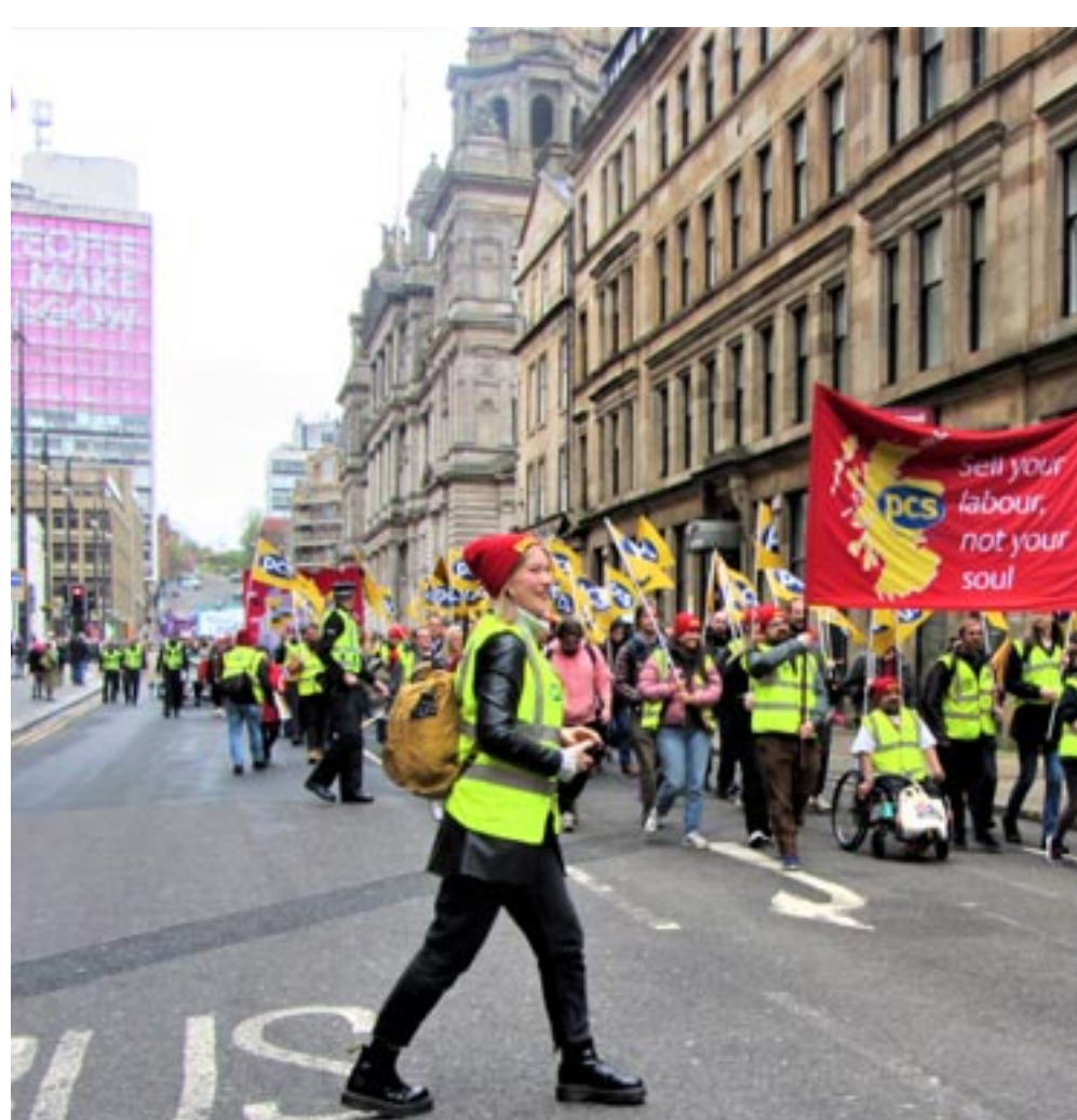
May Day 2023 march, Glasgow.

"We've been joined by a whole range of supportive trade unions – and the message here today, and it's a message