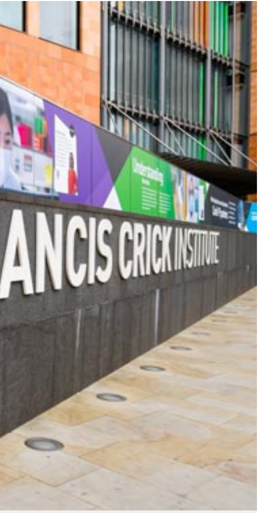
without the help of the European Union.

Europe will be "value for money". And it should be: the affiliation fee of some £2 billion per year is equivalent to around 20 per cent of Britain's budget for research and development in 2021.