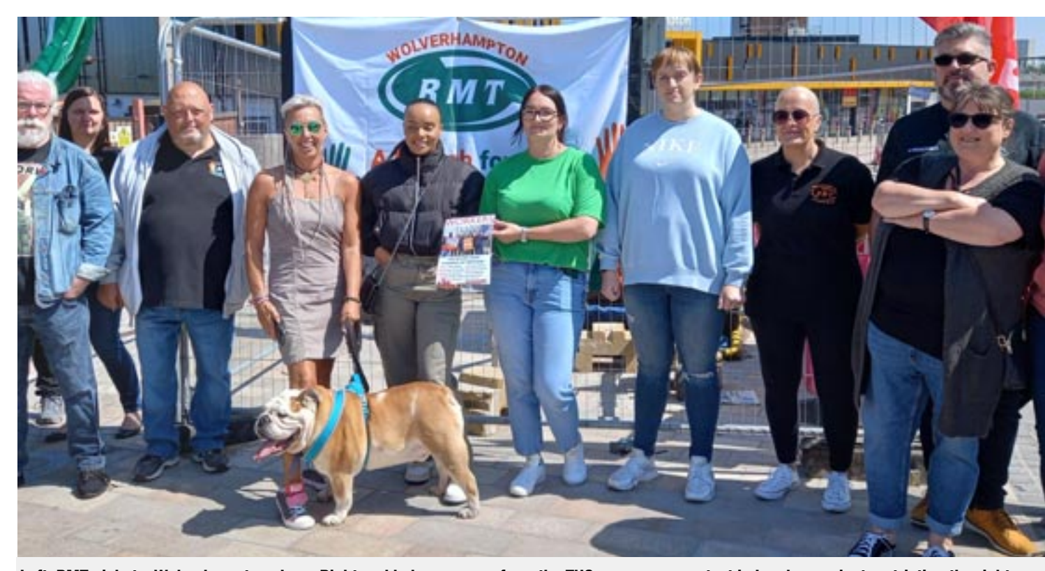
Left: RMT pickets, Wolverhampton, June. Right and below: scenes from the TUC emergency protest in London against restricting the right to strike, May.