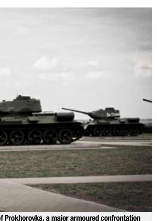
norovka, a major armoureu comfontation