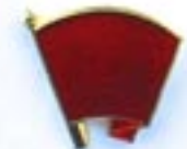
Red Flag badge, £1