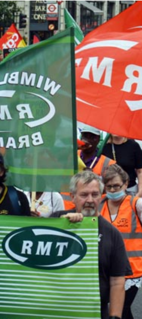
Head Office if an employer tries to use CPI.

Blair's Labour government from following its European dream.