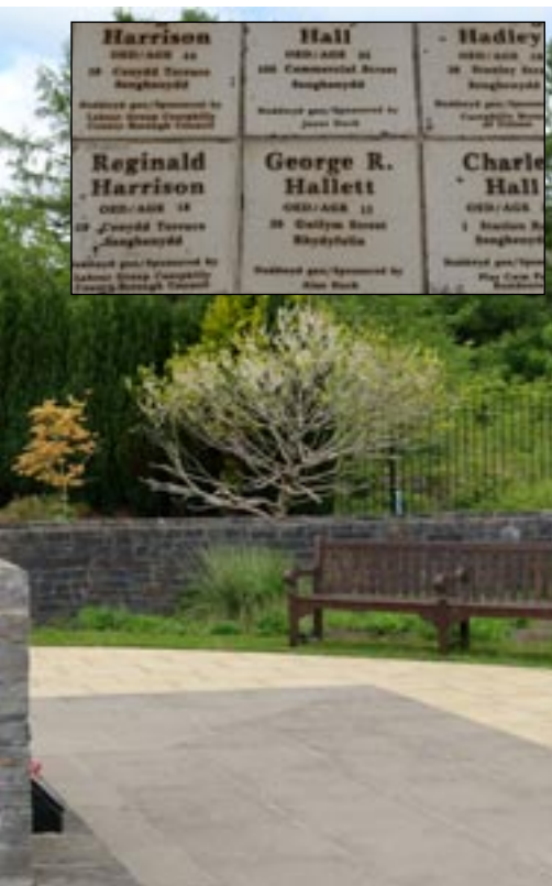
Senghenydd Colliery Memorial Garden at Senghenydd. The worker coming to the aid of a survivor. Inset: of those who died in October 1913.

September 1913 to implement changes to allow the fans to reverse. This was further extended to 30 September 1913.