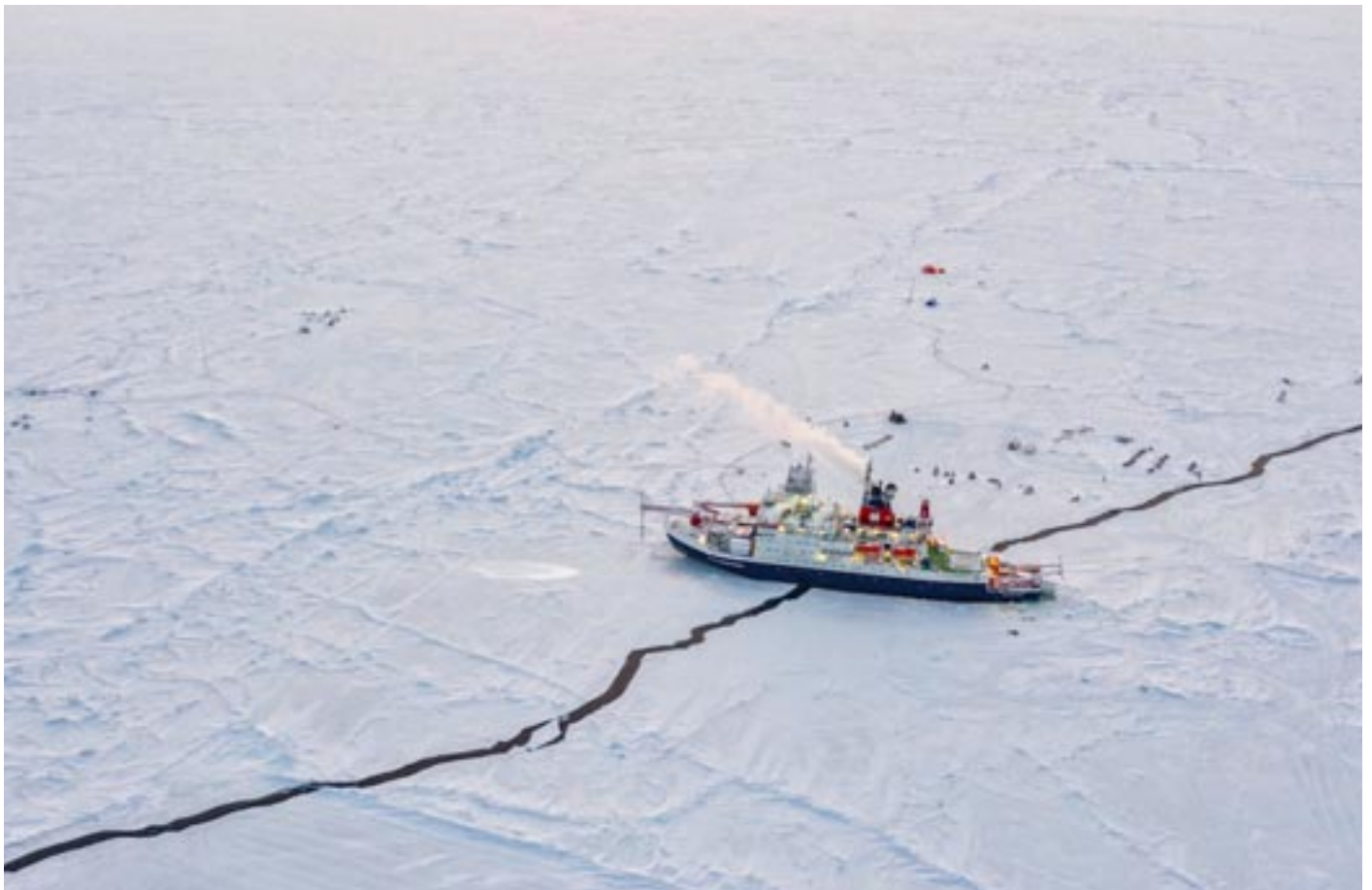
Manuel Ernst/UFA-Filmteam (CC BY 3.0)