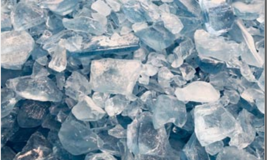
Crystals of sodium silicate.