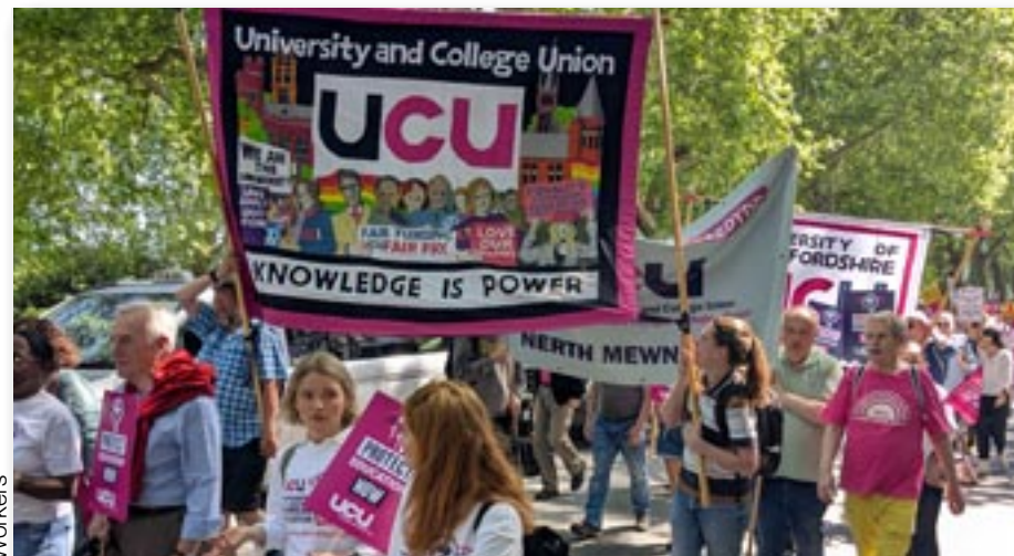
University workers campaigning to protect education, London, May 2025.

At least the Swiss could have their say on a matter of national importance – unlike Britain, where any mention of border control or the impact of immigration is shouted down as right wing and racist. ■