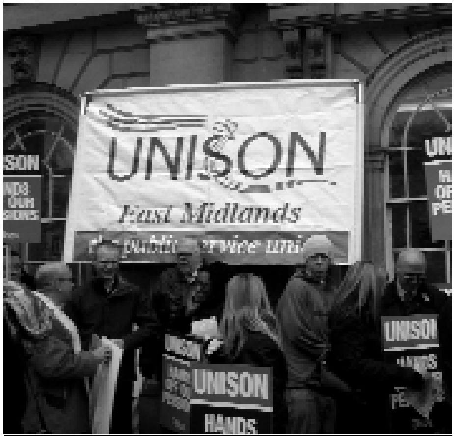
18 February 2005, Northampton: local government workers march over pensions.

the key reason for the attack on pensions has arisen and or our right to decide how our deferred wages are to be utilised – our sovereignty – is speeding into a cul de sac.