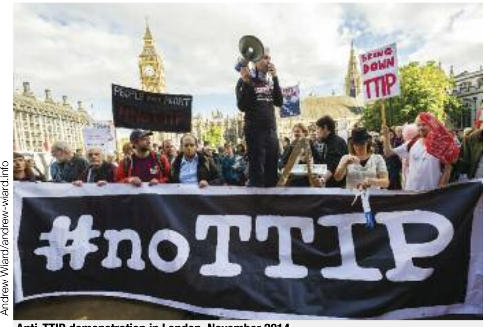
Anti-TTIP demonstration in London, November 2014.

In those countries that have not signed up to TTIP or TPP, governments are less dominated by transnational, essentially US, companies. So the clash is the old clash in new guise: capitalism against the people. A future war would be just that class-based war that bourgeois