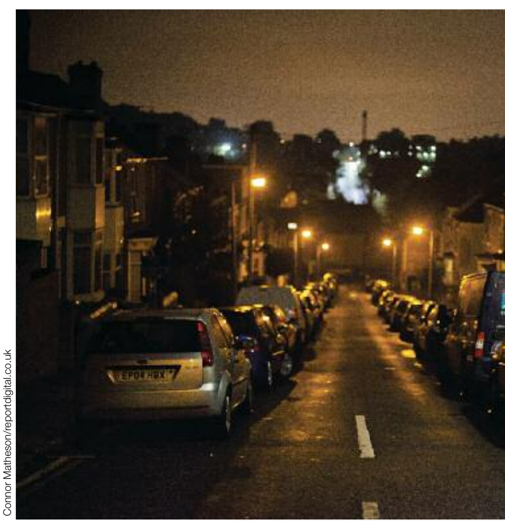
The abuse uncovered in Rotherham, dreadful as it is, is probably indicative of the situation in man

'Jay doesn't hold back from criticising police and social work professionals.'