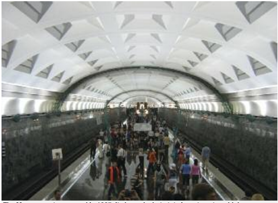
The Moscow metro: opened in 1935, it showed what state investment could do.

Keep up-to-date in between issues of Workers by subscribing to our free electronic newsletter. Just enter your email address at the foot of any page on our website, cpbml.org.uk