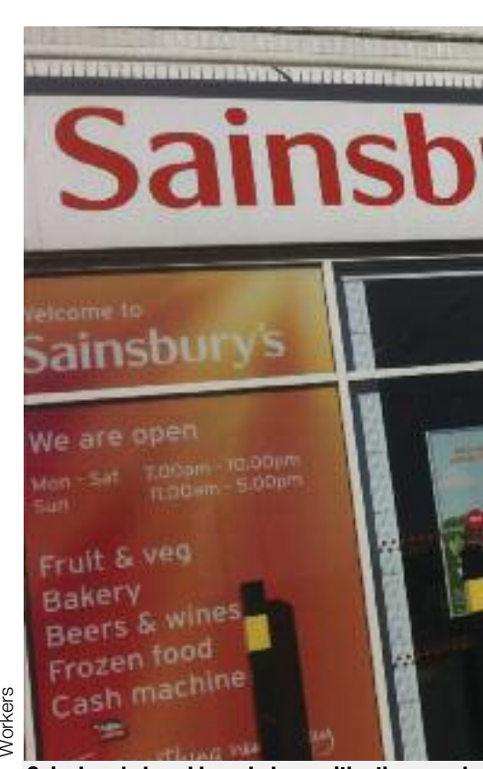
Sainsbury's Local brand along with others such

'Cost reduction is not about returning benefits to the consumer – it is about increasing profit.'