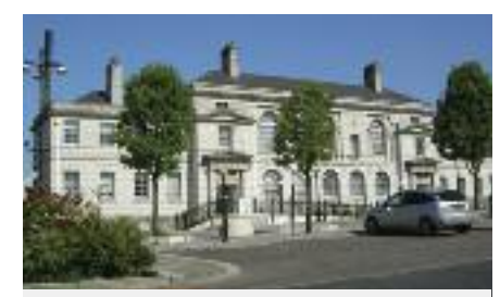
Rotherham town hall.

We have councillors, such as those in Rotherham, denying that there is a deep-rooted problem. The same councillors refuse to acknowledge that young girls are systematically abused and traded from within their own groups; they sit on the problem.