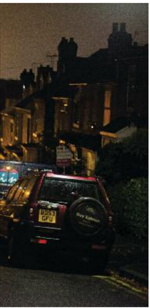
y other cities across the country.

was being undertaken by people who were connected by clan and family. Yet in Rotherham, the majority of known perpetrators were of Pakistani heritage. Latterly, some child victims of sexual exploitation and some of the perpetrators were of Roma Slovak origin.