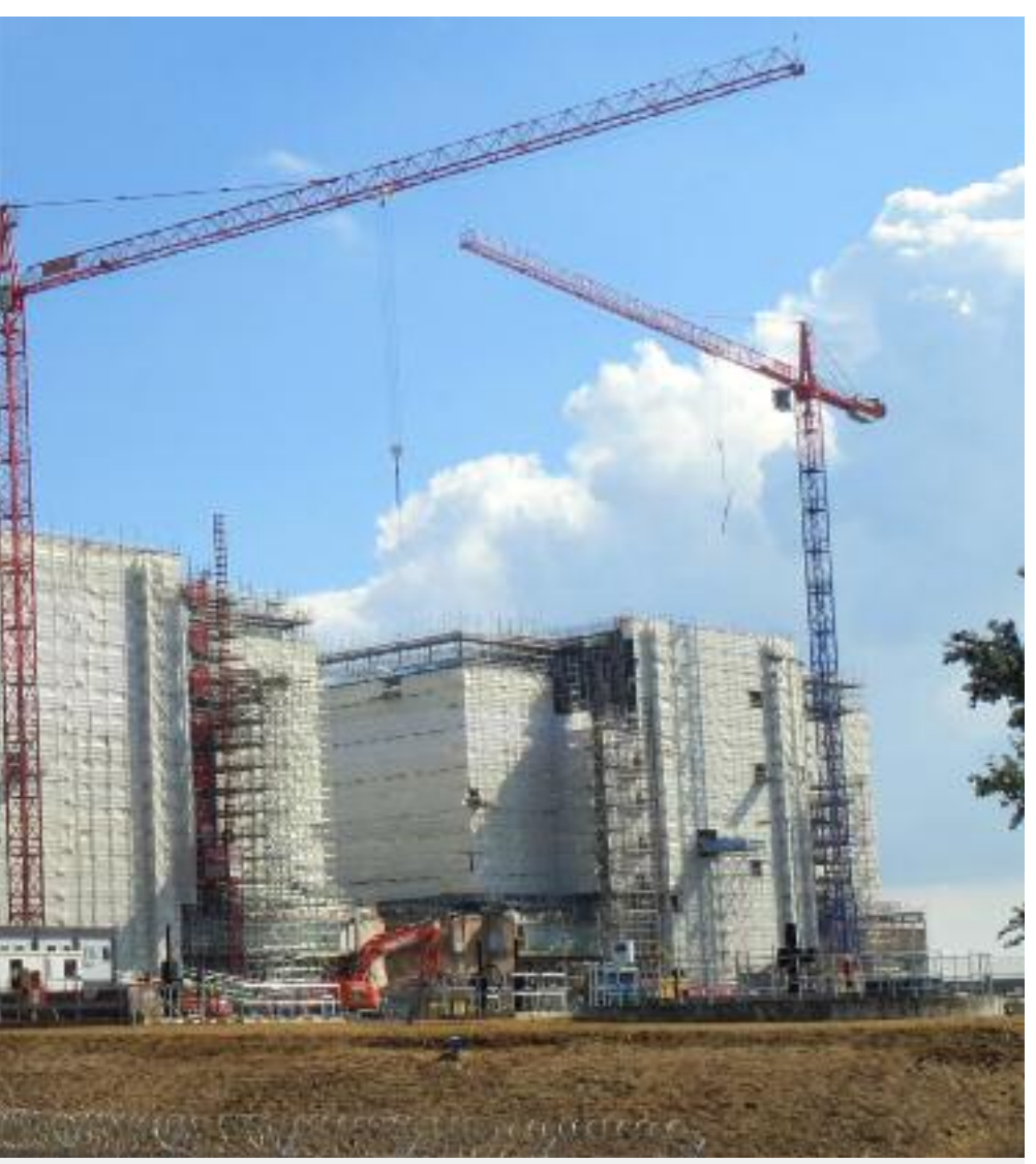
uclear power station, Essex, currently being decommissioned, with no replacement in sight.

on imported oil and gas left Britain exposed to spiralling prices and insecurity of supply. From 2006, the government began making tentative steps towards nuclear expansion. In the past eight years expectations have increased from an initial 1 gigawatt of power on stream by 2020 to 16 gigawatts, with the first reactor in place by 2018.