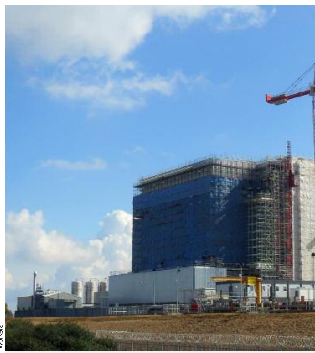
Deconstruction – just about the only growth industry in British energy. Photo shows Bradwell n

But we are less robust in our thinking when confronted by false attributes attached to particular forms of energy, as characterised by "coal bad, biomass good", or "internal combustion engine bad, solar