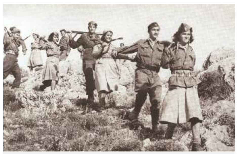
ELAS guerrillas: men and women fought against the Nazis, and after liberation ELAS and the Communist Party organised elections in the liberated areas where for the first time in Greece women were entitled to vote. But women were not enfranchised in the 1946 election following the reinstatement of the old order under British protection.

The Caserta Agreement in September 1944 put all the forces in Greece under the control of a British general, Sir Ronald Scobie. Britain moved to disarm ELAS,