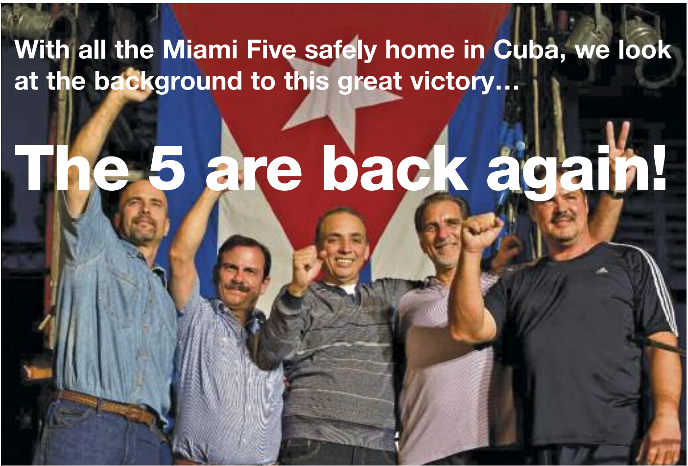
The Miami Five pose for the cameras on their return to Havana.

THE MIAMI FIVE are now all free and back home in Cuba with their families, after being released from US prisons by President Obama last December. To understand them and the relationship between Cuba and the US, we have to go back to the early post revolutionary era.