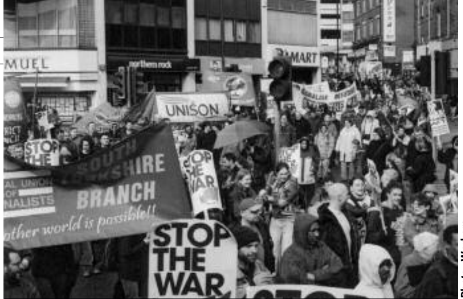
Against the war in Sheffield, one of the many regional centres that have seen large turnouts. See also "Iraq: Government and Parliament stand condemned", p6

TGB advertises services for "union avoidance" on its website and is known for its strong-arm tactics. The CWU is confident that they will win the ballot on 9 May as workers recognise the benefits of a unionised workplace.