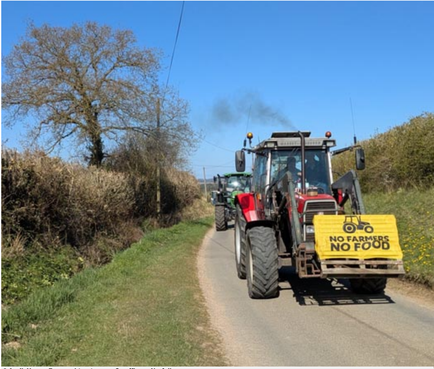
6 April: Young Farmers' tractor run, Swaffham, Norfolk.

FOOD PRODUCTION in Britain is in crisis. Attacks come from many directions: successive governments' climate change and net zero policies; tax changes; stubborn refusal to detach from the EU orbit; agricultural land grabs by developers; and the globally controlled companies that adulterate our food.