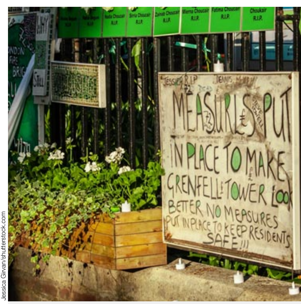
June 2022: memorial to the victims of the Grenfell tower five years after the fire.

'Without tighter regulations the conditions for corrupt practices had ripened to bursting point...'