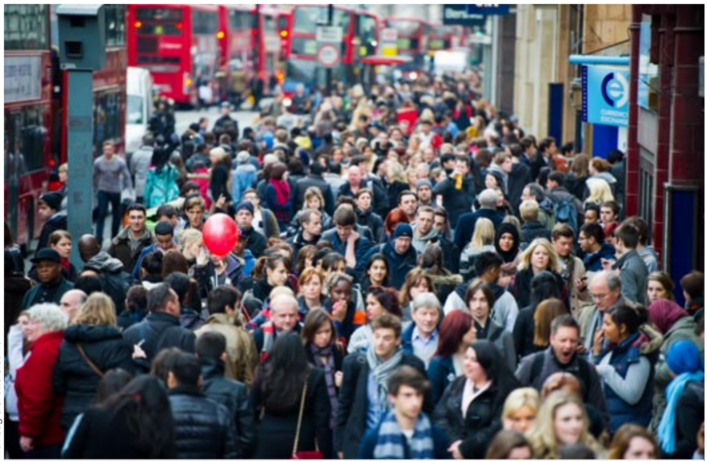
The working class makes up the overwhelming majority of people in Britain.

WHO IS a worker and what comprises the working class matter because society and politics are all about class. Anyone wanting to improve things, to tackle and solve problems, must first have a sound grasp of reality, of the material conditions in which people live. They have to be clear about class