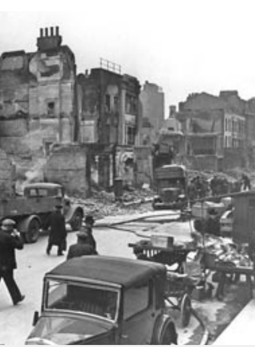
ged from the war in debt up to its eyeballs to the Public Domain)..

As there were six deferred instalments, this debt to the USA was only fully repaid by the British government in 2006. Although at the time Treasury Minister Ed Balls acclaimed it as "a sign that the UK repays its debts", what is probably unusual is that the debt was repaid at all, as Britain has a patchy record on debt repayments. There are unpaid debts that predate the Napoleonic Wars, and War Loan debts from the First World War were not paid off until 2015. And at the height of the Great Depression in 1931, a moratorium on all war debts was agreed and no debt repayments were made or received after 1934.