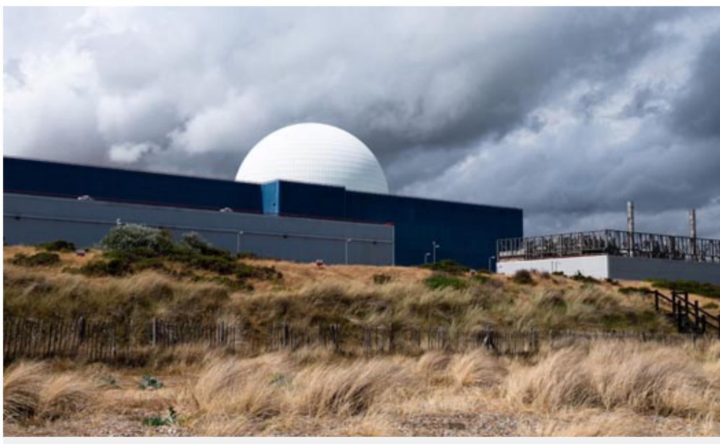
Sizewell B in Suffolk will be the last working nuclear power station in Britain after 2030.

THE NEWS that the prime minister Keir Starmer will give the go-ahead for the construction of a new nuclear power plant, Sizewell C in Suffolk, is welcome. This suggests that some of those in government are