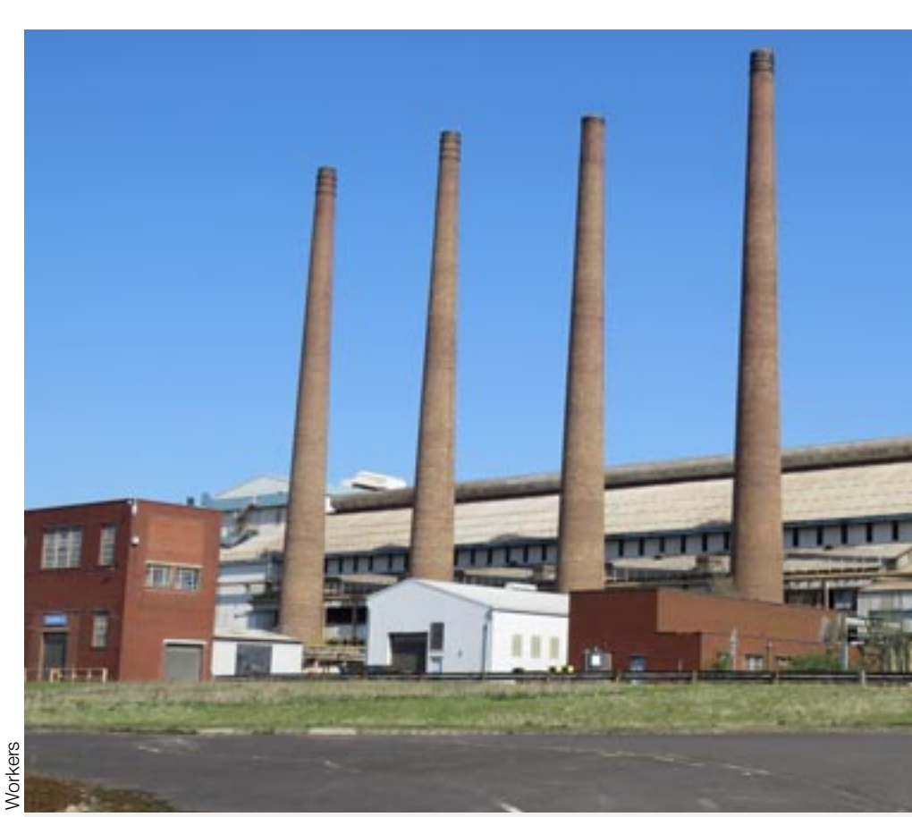
Liberty Steels Rotherham at Aldwarke. Hundreds of jobs and key steel production facilities are u

The national cost of housing asylum seekers reached around £8 million a day in