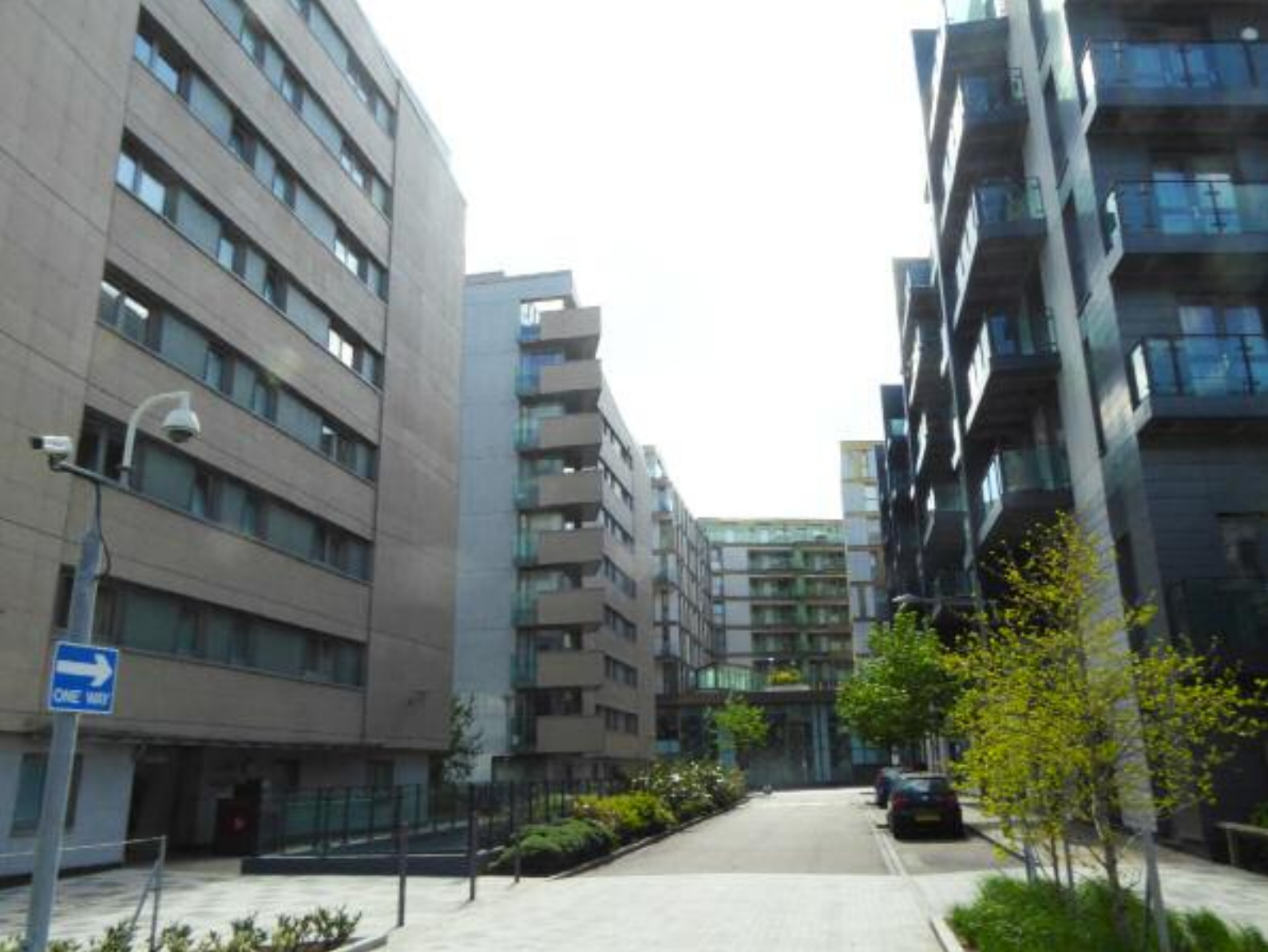
New housing in Tottenham Hale, London. Prices start at £249,995 for a one-bedroom studio flat. A two-bedroom flat is rented for £1,625 a month but it would be grim for children, with only a tiny playground surrounded by concrete. This development, over a brown field site, is now planned to extend over Tottenham Marshes. Haringey Council rejected the plan to build up to 505 homes there including a 21-storey tower, over concerns that it would be too tall and adversely impact green belt land. London Mayor Sadiq Khan has intervened and plans to push through the development in some form upon the marshland.

until they become health and safety hazards. This should be treated as a criminal offence.