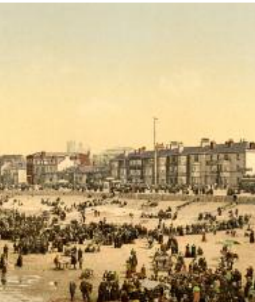
Blackpool, in the 1890s, taken from South Pier.

holiday with pay, reflecting the vast number of union applications made in all parts of the country.