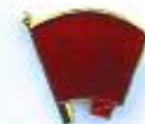
Red Flag badge, £1