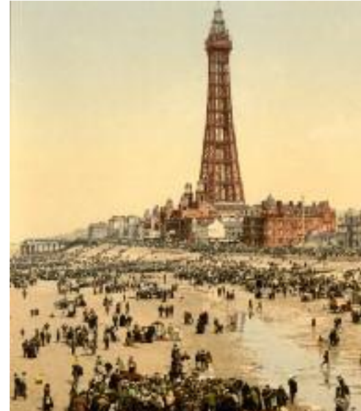
Photochrom print of the Promenade and Tower, London, 1900.

Between 1918 and 1933 the trade unions' holiday-with-pay campaign energised their own members, presented a case to employers and the state, influenced the