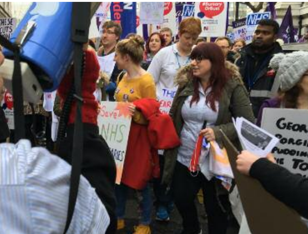
but the degree places, then they imported EU nurses and therapists – then they stopped the bursaries.

expensive and unethical, they did work out cheaper for the Treasury in the short term.