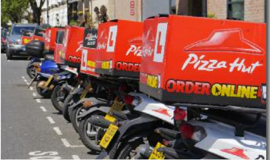
The minimum wage has spread throughout industries such as retail and food.