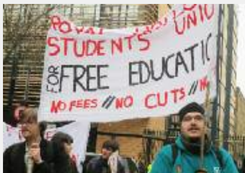
Students on the march in London, 2014.

A SHARP INCREASE in inflation means millions of students and former students will see a rise in interest rates on tuition and maintenance loans this year. Rates on student loans taken out in England and Wales since 2012 are set at 3 per cent plus the retail prices index (RPI). With March's RPI rising to 3.1 per cent, students will be hit with interest charges of up to 6.1 per cent from September, up from 4.6 per cent: an increase of a third. The rate increase will apply to all students who enrolled at university after 2012,