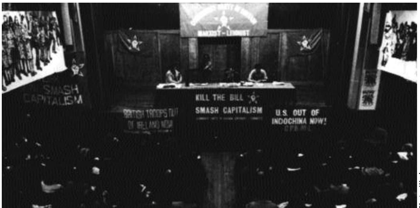
Communist Party meeting at Conway hall from the 1970s: the party has held a May Day meeting in the hall every year since 1968

Richard Dawkins, the scientist, was the fourth speaker of the evening. He discussed his work in both Britain and the United States. He pointed out that the