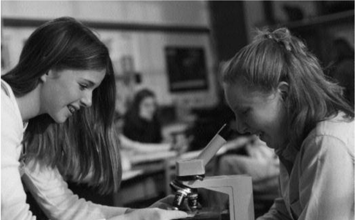
The government aims to give extra funding to specialist schools – and penalise those that don't accept this “challenge”