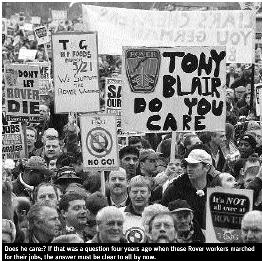
Does he care?: If that was a question four years ago when these Rover workers marched for their jobs, the answer must be clear to all by now.

Actually Ian McCartney, Chair of the Labour Party, won the hearts and minds of trade unionists in a hilarious speech at the usually private General Council dinner. He made a heartfelt and subtle appeal for