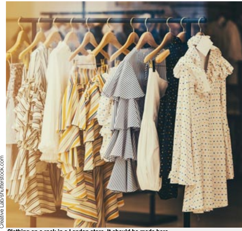
Clothing on a rack in a London store. It should be made here.

"We can't just take what works in Asia and expect it to work here."