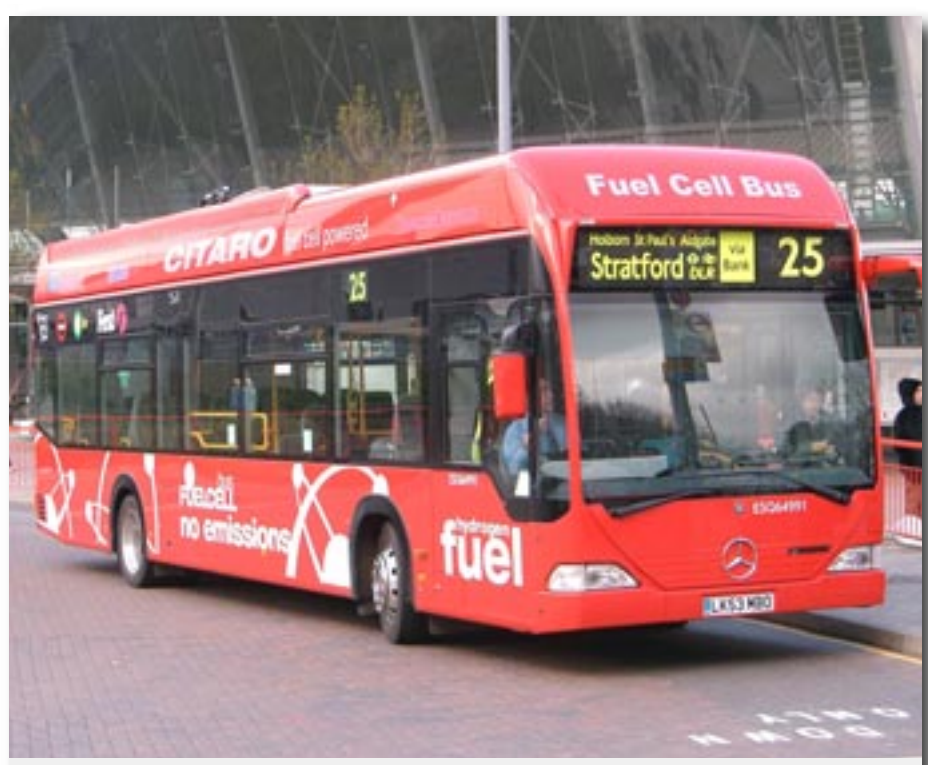
A hydrogen fuel cell bus at Stratford, east London - 16 years ago. Where is it now?

Current technology may not be the whole answer. We must also explore other potential sources such as hydrogen (see Box) for a cleaner future for Britain.