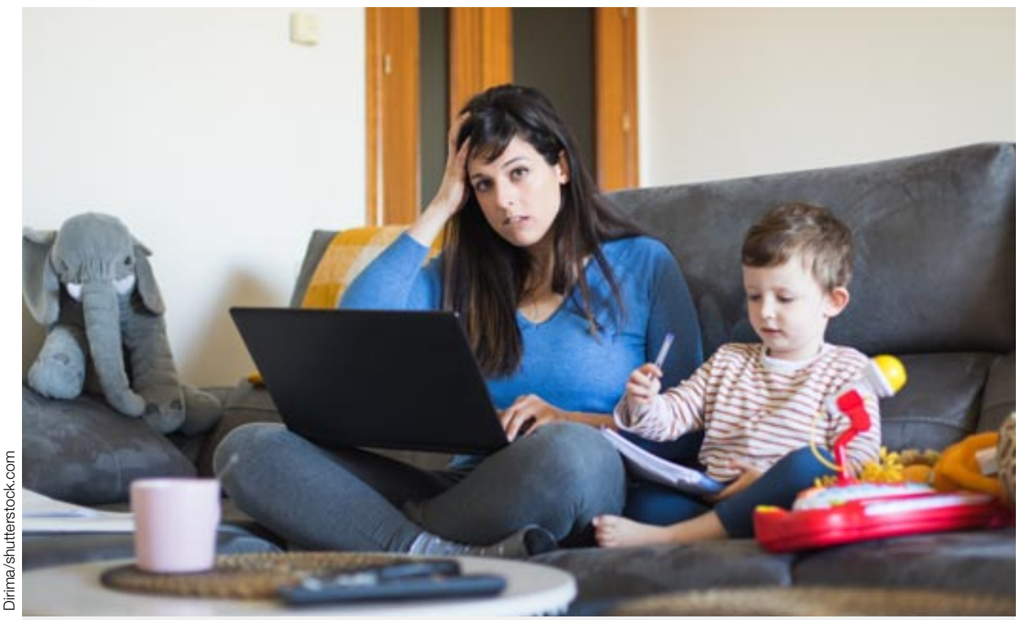
Unsurprisingly, research has shown that women have born the brunt of the competing demands of homework and childcare.

IT IS HARD to overestimate the change involved since March 2020 when so many workers started to work from home. It's a complex picture, with some workers welcoming the change and others finding it highly stressful. Initially it was a necessity for employers, but many companies are now considering their options. Keen to offload the costs of an office, they are wondering if this saving can become permanent.