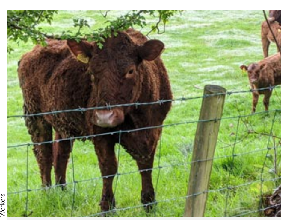
Limousin heifer, Wales. Almost 600 farms straddle the Welsh and Scottish borders with England, rendering separatism a hindrance to a national strategy.