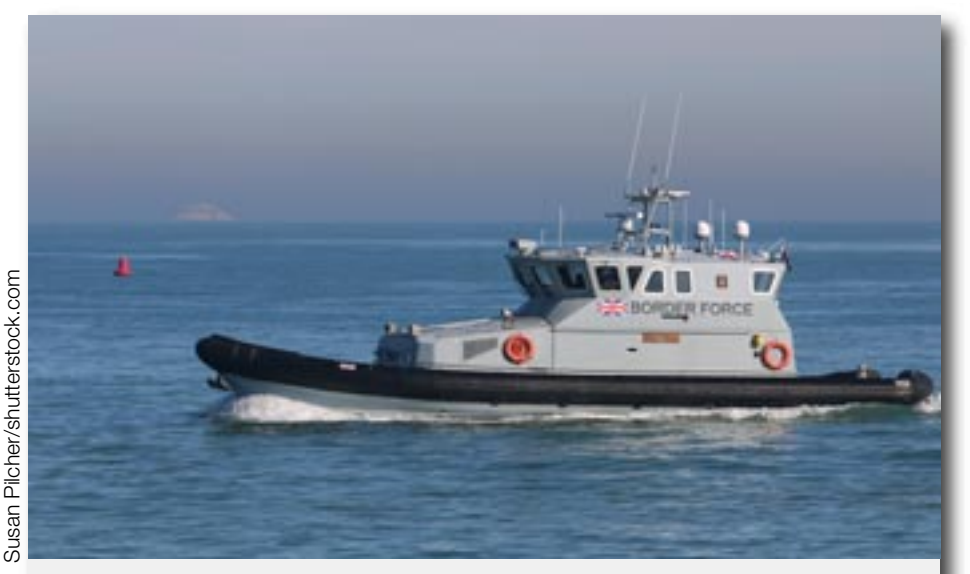
Border Force vessel returning to Folkestone.