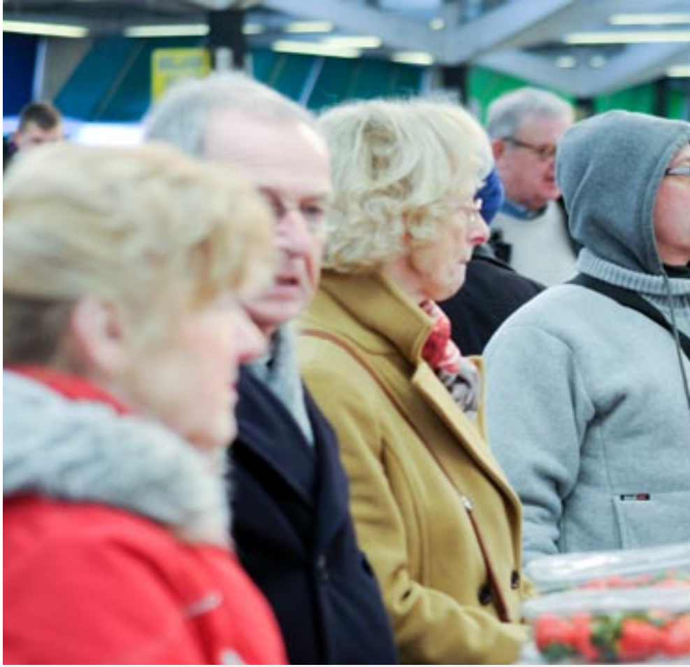
Open-air food market, Leicester.

'Some blithely suggest that the market will provide...'