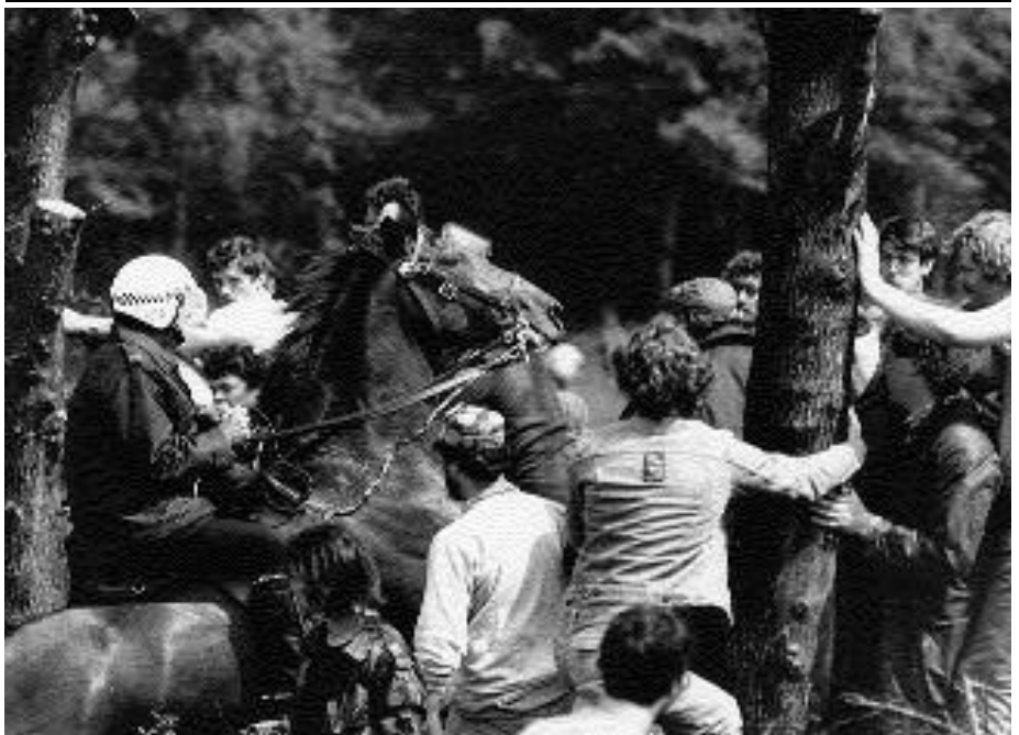
...and alone again: the miners against Thatcher