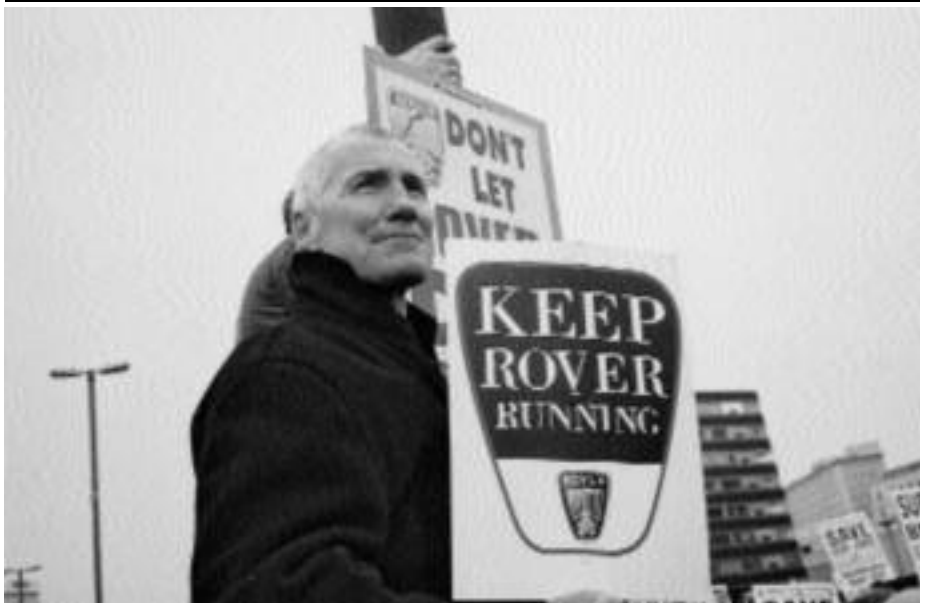
...and again, though this time successful, at Rover