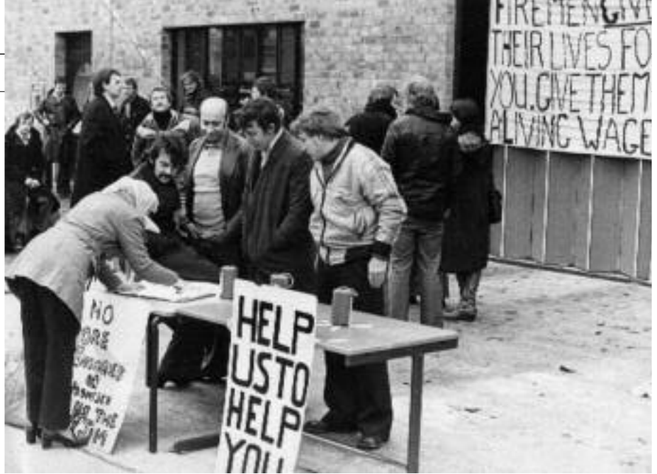
Left to fight alone: the firefighters against the Social Contract