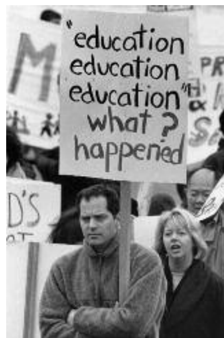
The Government must learn to attack the problem, not the professionals

The report, by Peter Birks, says the Department for Education and Employment has failed to take local